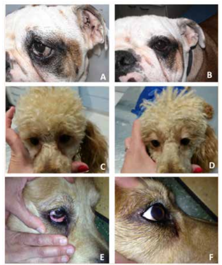
Figure 2. Graphical representation of eyes improvement before (A, C, E) and after (B, D, F) 1 month of the nutraceutical diet supplementation

comparisons test. A p < 0.05 was considered significant.